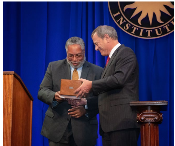
Roberts with Lonnie Bunch III as the latter is installed as Smithsonian Secretary on Nov. 1, 2019.

Neither Roberts (still has shares in five companies) nor Breyer (still has eight) nor Alito (28) bought stocks in 2019, and Alito sold Oracle shares. (A year-over-year chart of the justices' stock ownership is available here .)