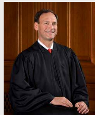
Associate Justice Samuel Alito