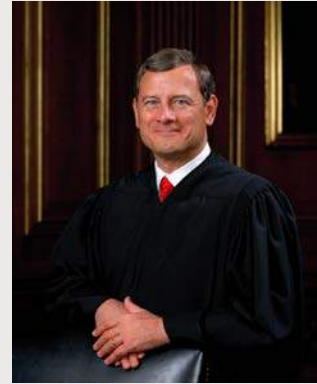
Chief Justice John Roberts

Each time this scenario occurred, the justices who owned shares of the company that filed the brief sat on the case. Further, they voted with these amici nearly 70 percent of the time, on issues ranging from affirmative action to mandatory arbitration to corporate immunity for violations of international law. But should the justices have been hearing the cases to begin with? Fix the Court believes the answer is "no."